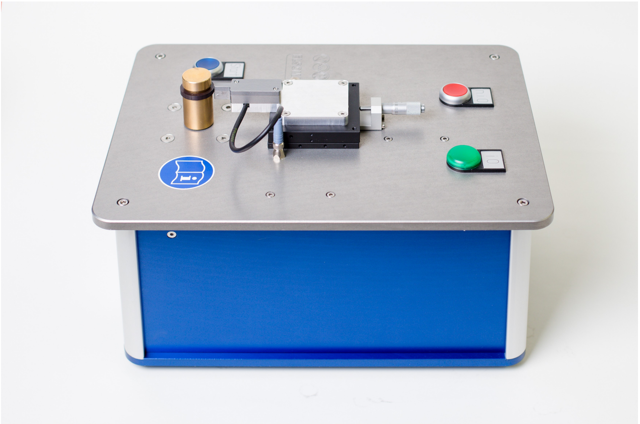
Angle Based Magnetic Flux Density Meter for Radial Measurement A05